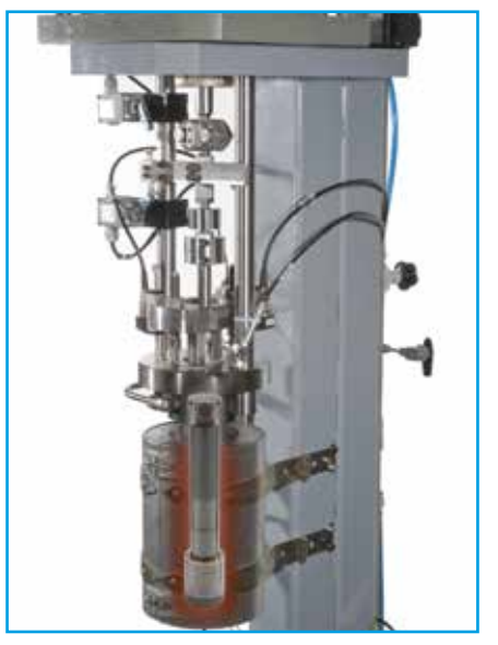
PHOTO Left: In the tests without prior surface treatment by rolling, considerable graphite deposits were observed on the spindle. Since they are subjected to extreme loads during use, they require hard, oxidation and wear-resistant surfaces.

PHOTO Right: The test bench was designed to investigate the friction and sealing properties of the packaging materials. The tightness was measured in the spatially closed system of stuffing box housing, connected leakage device and shut-off valve, and the test medium used was nitrogen.