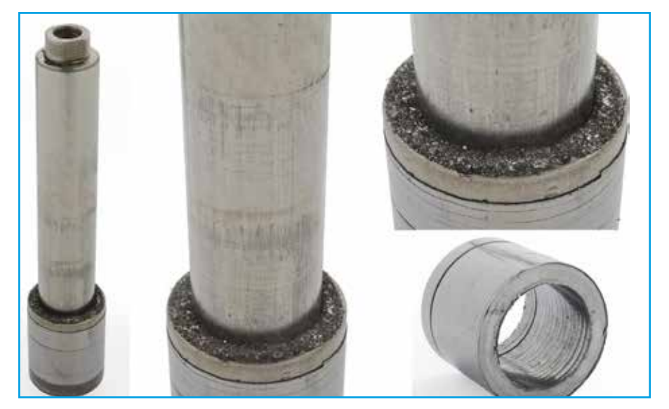
PHOTO Left: A spherically shaped and finely polished diamond is moved under pressure over the workpiece surface. By using these enormous forces, the inherent stresses of the material is increased, so that the burnished surface hardens by five to ten percent. This has a positive effect on the reliability of the function as well as on the emission rate of the valves.

as the bearing area curve or bearing curve, can be used. This represents different values: the value Rpk to the peak height, the depth of the groove Rvk as well as the core depth Rk.